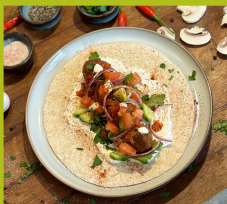
Lunch: Mushroom Ball Wrap