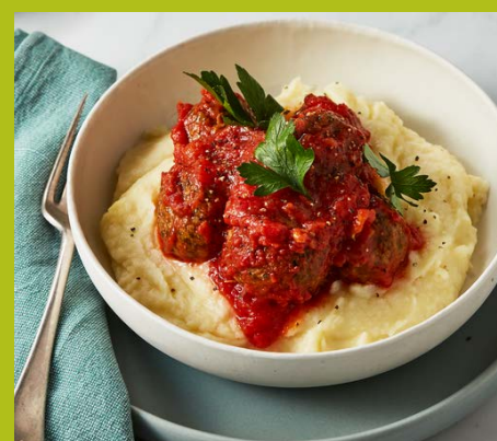
Dinner: Mushroom Balls and Mash