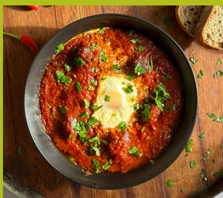
Breakfast: Mushroom Ball Shakshuka

Elevate your menu with our irresistibly delicious & versatile Froom™ Mushroom Balls. They are a perfect plant-based alternative for a range of cuisine types, any time of day.