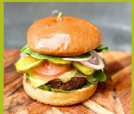
Dinner: Mushroom Cheese Burger