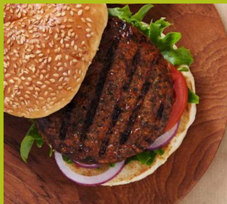
Lunch: Light & Lean Mushroom Burger