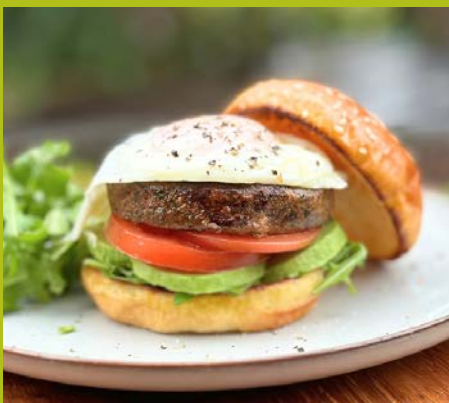
Breakfast: Mushroom Brekkie Burger

Discover a burger like no other, expertly crafted from mushrooms. Our Froom™ Mushroom Burger delivers an exceptional feast of taste, texture, and flavour.