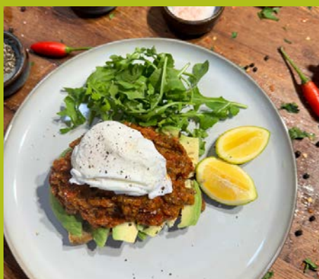
Breakfast: Mushroom Mince on Toast

Experience a culinary revelation with our delectable all-purpose Froom™ Mushroom Mince, perfect for elevating any dish, any time of the day.