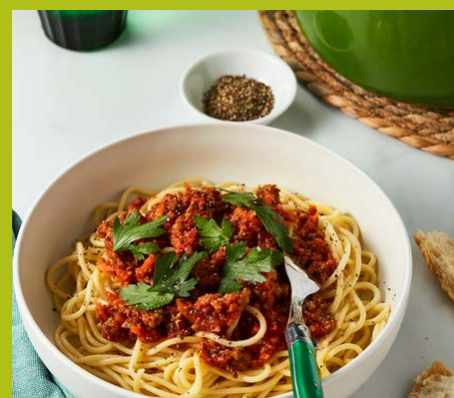
Dinner: Mushroom Mince Bolognese