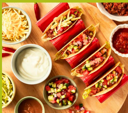
Lunch: Mushroom Mince Tacos